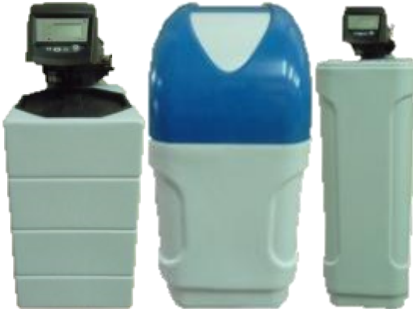
8L without Cover / 8L with Cover / 21L with Cover